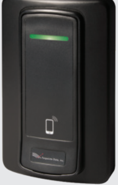
Mounts to single-gang wall switch box

Conekt Mobile Smartphone Access Control Solution